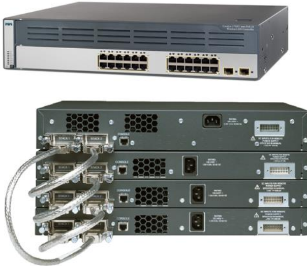
Figure 2. Unified Wireless LAN with the Cisco Catalyst 3750G Integrated Wireless LAN Controller